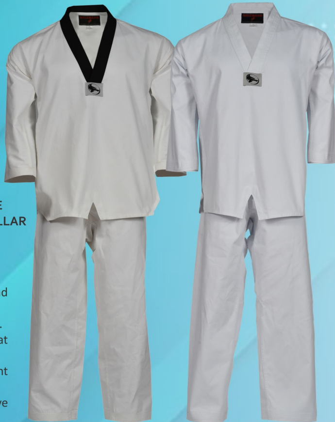
Art No#: PTKD-WHITE WITH BLACK COLLAR

Ribbed Cotton/Polyester blend fabric for easy care. Elastic waist with drawstring tie. Reinforced double stitched flat seams. Full cut design and 3-piece pant gusset. Extra strength and room to move for a perfect fit.