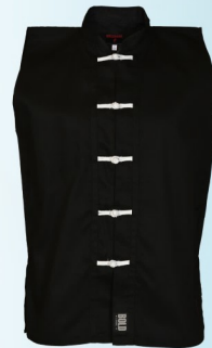
Art No#: 1100-BW