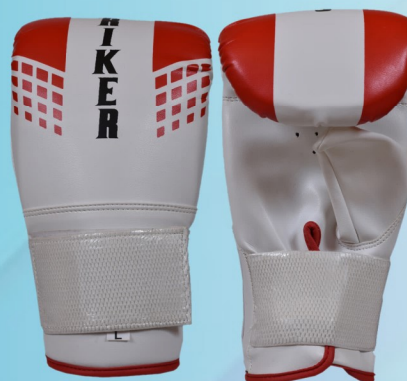
Art No#: BG-2204