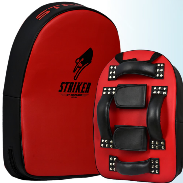
Art No#: BG-2105