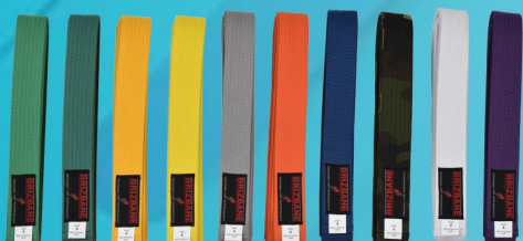
SOLID COLOR BELTS Art No#: BELT-001002