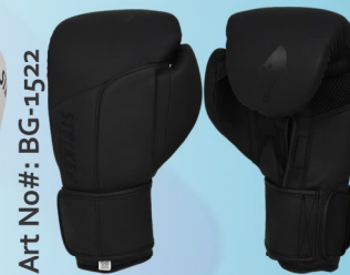
Art No#: BG-1522