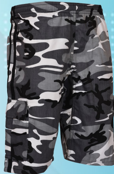
Art No#: 780-WCAM