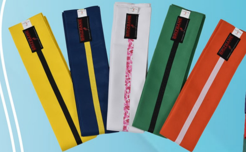
KUNG FU PC-SASH Art No#: SASH-001002