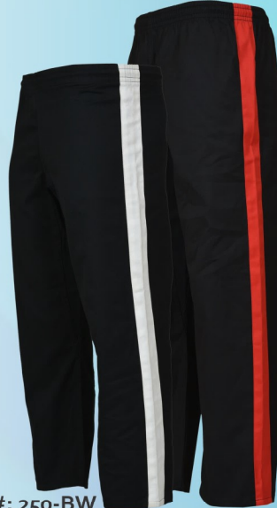
Art No#: 250-BW