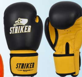
Art No#: BG-1517