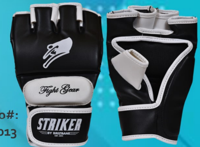
Art No#: BG-2013