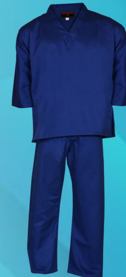
Art No#: 200-BL