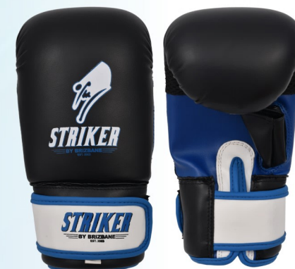
Art No#: BG-2203