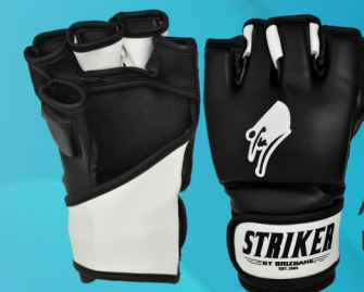
Art No#: BG-2014