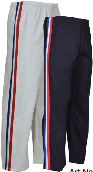
Art No#: 218-W