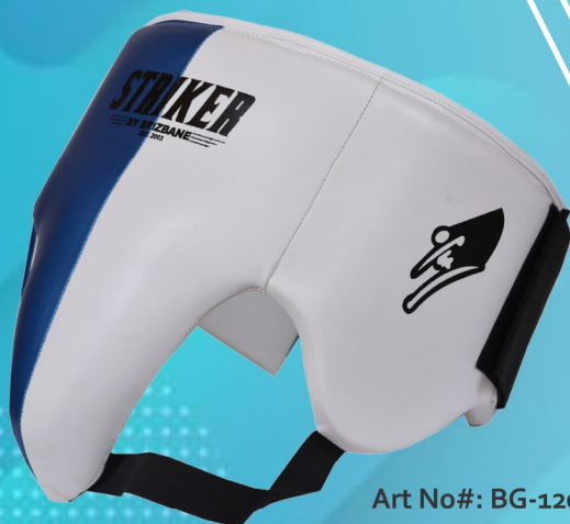
Art No#: BG-1202