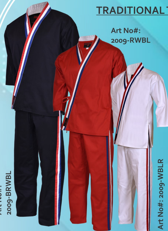
Art No#: 2009-BRWBL