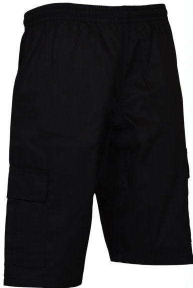
Art No#: 780-B