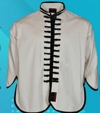
Art No#: 1310 WB

Cotton/Polyester fabric for easy care. Reinforced double stitched flat seams. Full cut design for comfort & flexibility. Extra strength and room to move for a perfect fit.