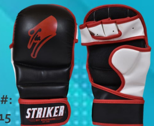
Art No#: BG-2015