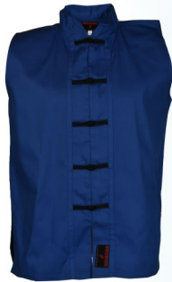
Art No#: 1100-BLB