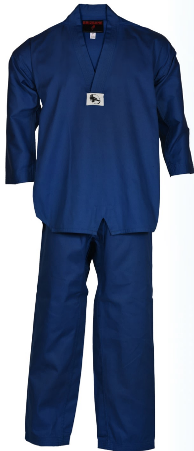
Art No#: TKD-BLUE