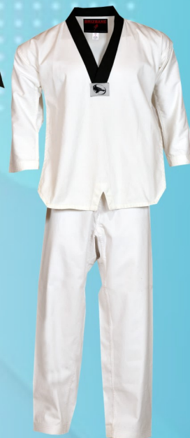
Art No#: TKD-WHITE/BLACK COLLAR