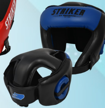
Art No#: BG-1703