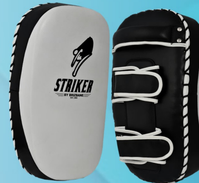
Art No#: BG-2106