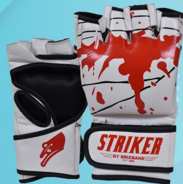
Art No#: BG-2001