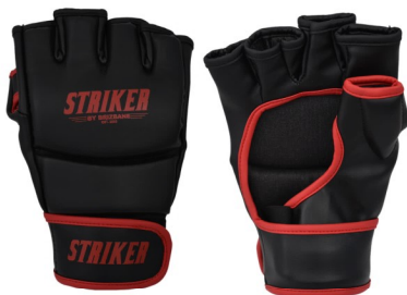
Art No#: BG-2012