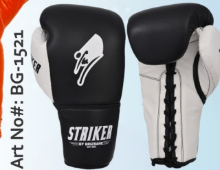
Art No#: BG-1521