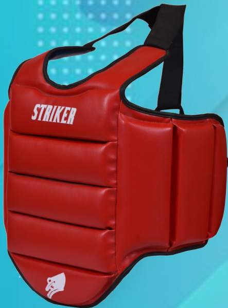
Art No#: BG-1801

Description: Artificial Leather. 1.5" Elastic & Velcro closing. EVA Foam padding. Size: XS to XXL.