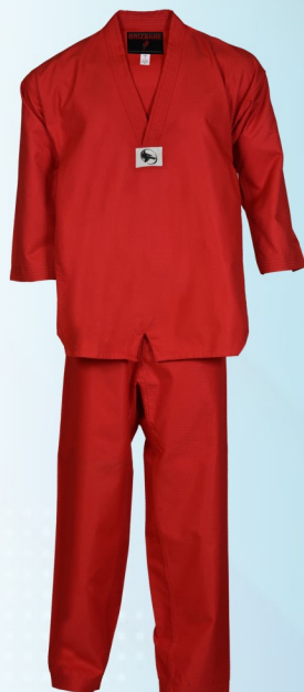
Art No#: TKD-RED