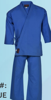
Art No#: 500-BLUE