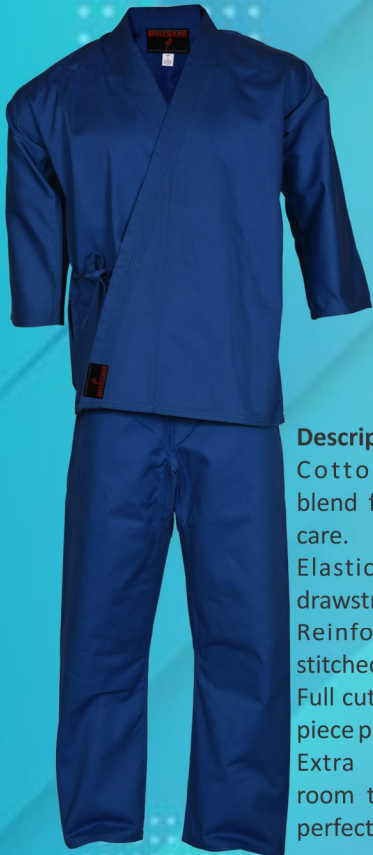
Art No#: 350-BLUE

Description: Cotton/Polyester blend fabric for easy care. Elastic waist with drawstring tie. Reinforced double stitched flat seams. Full cut design and 3-piece pant gusset. Extra strength and room to move for a perfect fit.