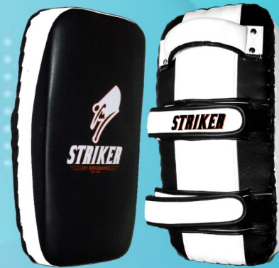
Art No#: BG-2102