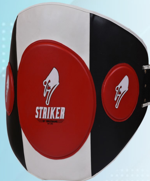
Art No#: BG-1802

Description: Artificial leather. 3" Velcro closer. EVA Jumbo padding. Size: XS to XXL.