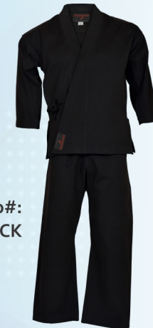
Art No#: 500-BLACK