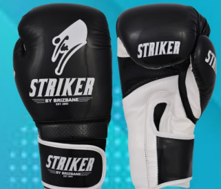
Art No#: BG-1525