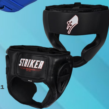
Art No#: BG-1711