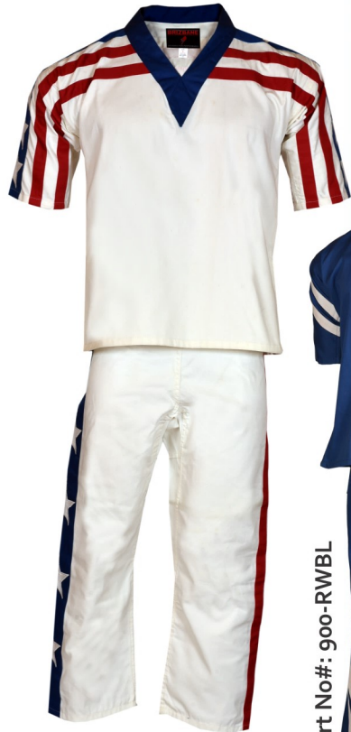
Art No#: 2016-WBLR