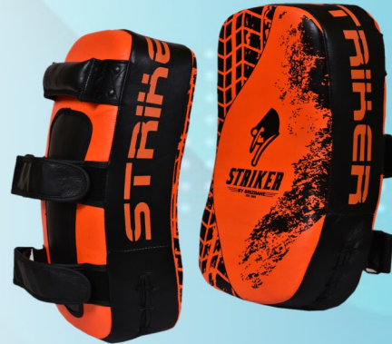
Art No#: BG-2101