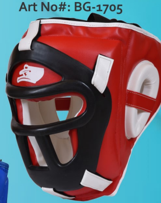
Art No#: BG-1705