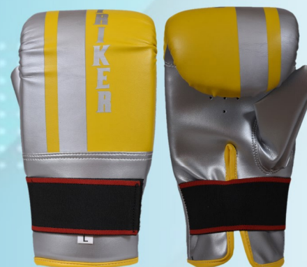
Art No#: BG-2202