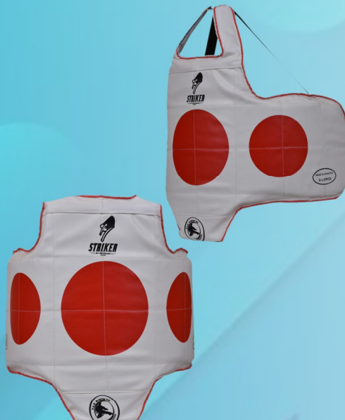
Art No#: BG-1803

Description: Artificial leather. 1" Elastic with webbing plastic buckle closer. EVA Foam padding. Size: XS to XXL.