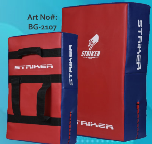
Art No#: BG-2107