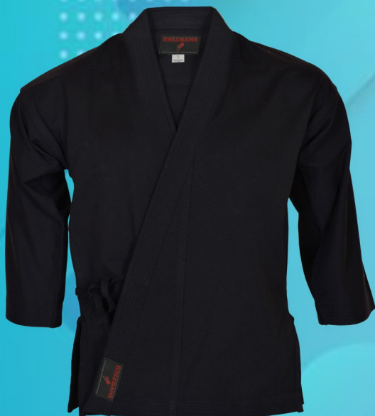
Art No#: 502-BLACK

100% Brushed Cotton Fabric Reinforced double stitched flat seams. Extra strength and room to move for a perfect fit.