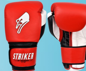
Art No#: BG-1519