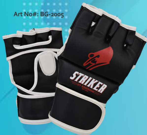
Art No#: BG-2005