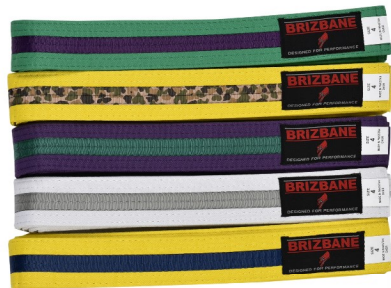
BELTS WITH SINGLE STRIPE Art No#: BELT-001010

Description: Poom belts. 11 Rows of stitching. Made of Poly/Cotton blend fabric for easy care.