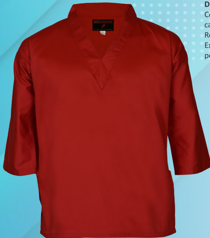
Art No#: 202-R