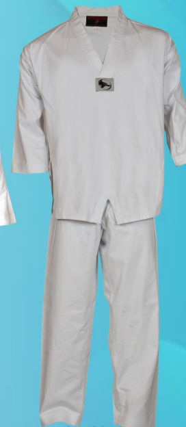
Art No#: TKD-WHITE