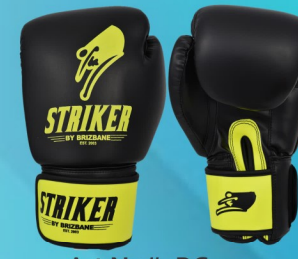
Art No#: BG-1524