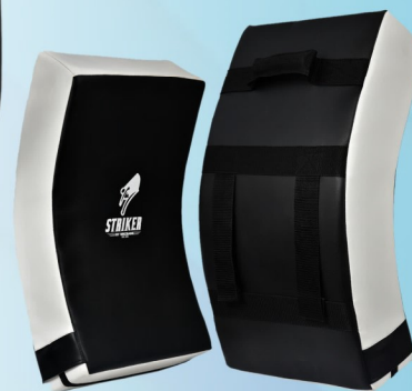
Art No#: BG-2104