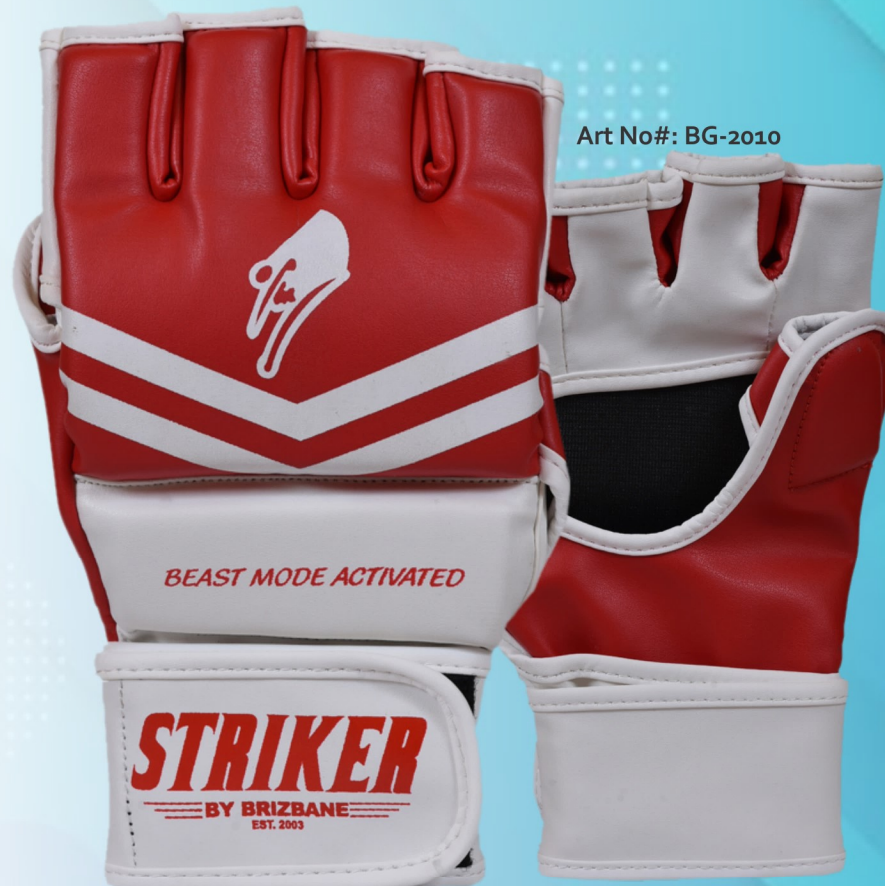
Art No#: BG-2010