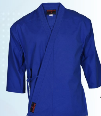
Art No#: 552-BLUE

100% Brushed Cotton Fabric. Reinforced double stitched flat seams. Extra strength and room to move for a perfect fit.