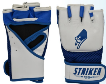
Art No#: BG-2011