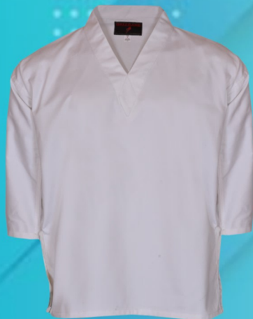
Art No#: 202-W