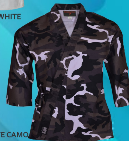
Art No#: 352-WHITE CAMO