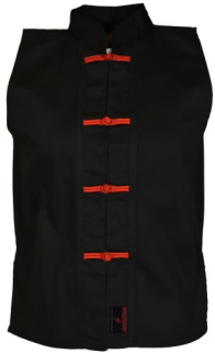
Art No#: 1100-BR