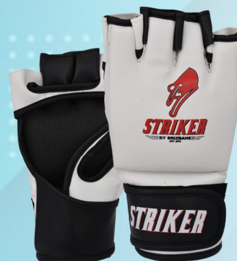
Art No#: BG-2002