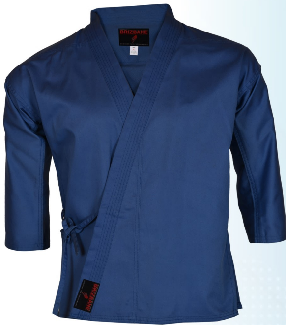
Art No#: 352-BLUE

Cotton/Polyester blend fabric for easy care. Reinforced double stitched flat seams. Full cut design for comfort and flexibility. Extra strength and room to move for a perfect fit.