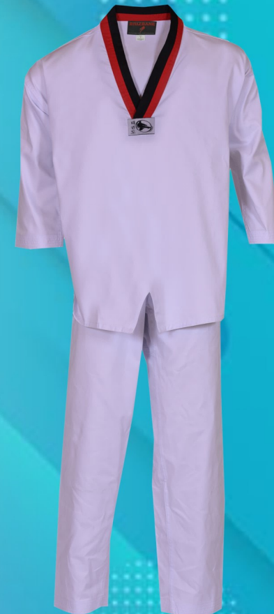
Art No#: TKD-POOM