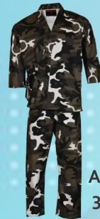
Art No#: 350-WCAM