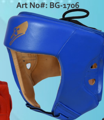
Art No#: BG-1706