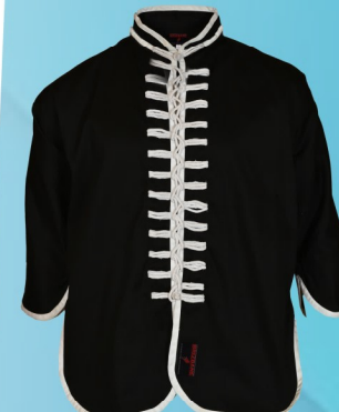
Art No#: 1310-BW