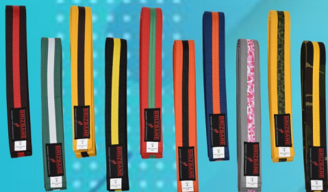
BELTS WITH STRIPE Art No#: BELT-001001