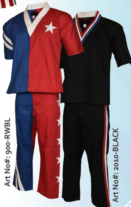
Art No#: 900-RWBL