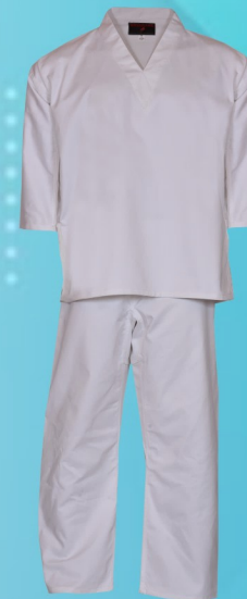
Art No#: 200-W