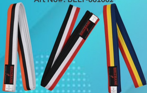
H/H BELTS WITH STRIPE Art No#: BELT-001003