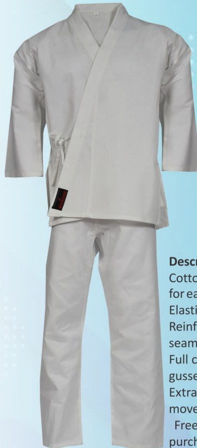
Art No#: 305-WHITE

Cotton/Polyester blend fabric for easy care. Elastic waist with drawstring tie. Reinforced double stitched flat seams. Full cut design and 3-piece pant gusset. Extra strength and room to move for a perfect fit.