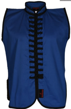
Art No#: 1110-BLB