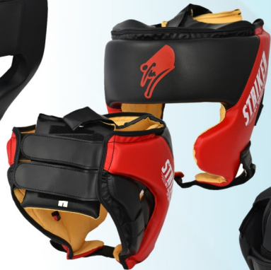
Art No#: BG-1702