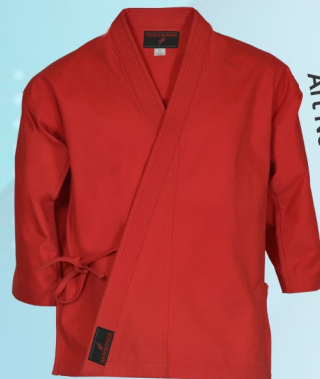
Art No#: 502-RED