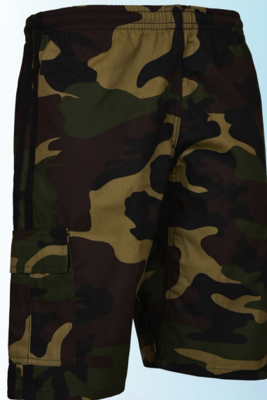
Art No#: 780-CAMB