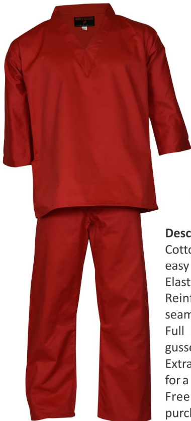
Art No#: 200-R

Cotton/Polyester blend fabric for easy care. Elastic waist with drawstring tie. Reinforced double stitched flat seams. Full cut design and 3-piece pant gusset. Extra strength and room to move for a perfect fit. Free white belt included with purchase.