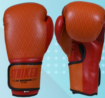
Art No#: BG-1515