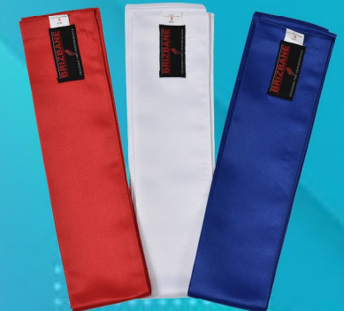
KUNG FU SATIN SASH Art No#: SASH-001003