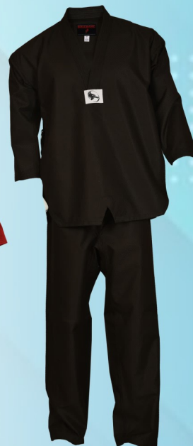
Art No#: TKD-BLACK