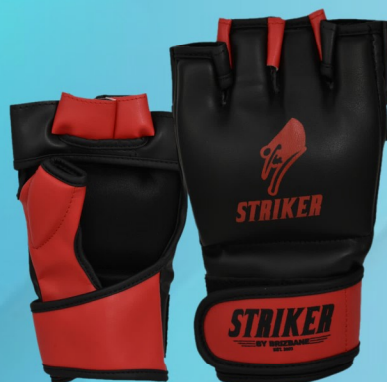
Art No#: BG-2007