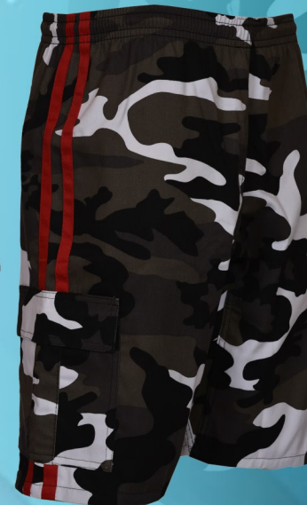
Art No#: 780-WCAMR