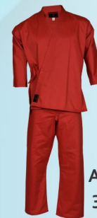
Art No#: 350-RED