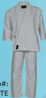
Art No#: 500-WHITE