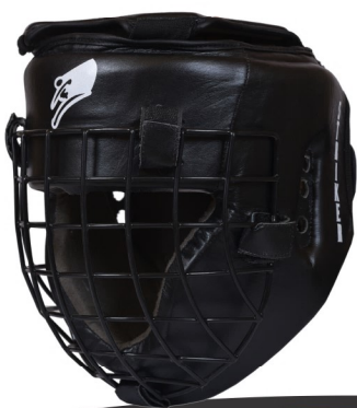
Art No#: BG-1709