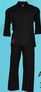
Art No#: 350-BLACK

Description: Cotton/Polyester blend fabric for easy care. Elastic waist with drawstring tie. Reinforced double stitched flat seams. Full cut design and 3-piece pant gusset. Extra strength and room to move for a perfect fit.