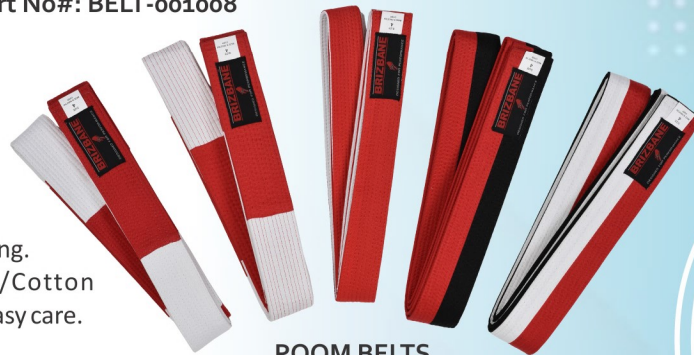
POOM BELTS Art No#: BELT-001009

Description: 2INCH Belts. 11 Rows of stitching. Made of Poly/Cotton blend fabric for easy care.