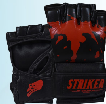
Art No#: BG-2003