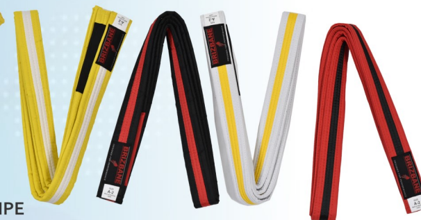
BJJ BELTS WITH STRIPE Art No#: BELT-001007