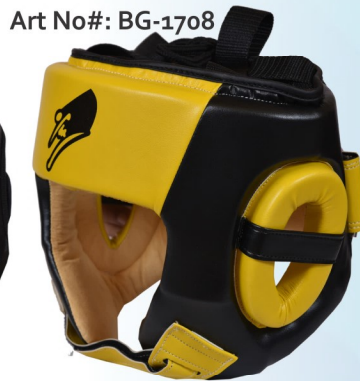
Art No#: BG-1708