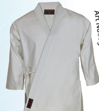
Art No#: 502-WHITE