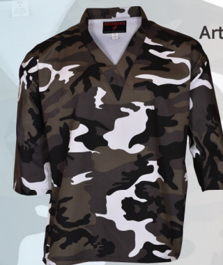
Art No#: 202-WCAM

Reinforced double stitched flat seams Extra strength and room to move for a perfect fit