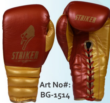
Art No#: BG-1514