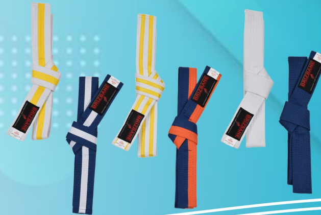
FEAR KNOT BELTS Art No#: BELT-001011

Description: 1 3/4" belts with single stripe (4cm & 2mm). 7 Rows of stitching. Made of Polyester fabric for easy care