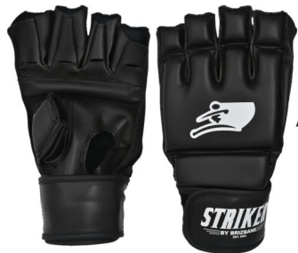
Art No#: BG-2009