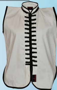
Art No#: 1110-WB