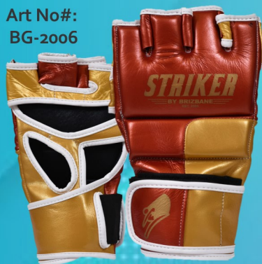
Art No#: BG-2006