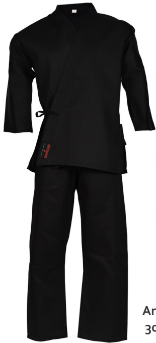
Art No#: 305-BLACK

Cotton/Polyester blend fabric for easy care. Elastic waist with drawstring tie. Reinforced double stitched flat seams. Full cut design and 3-piece pant gusset. Extra strength and room to move for a perfect fit.