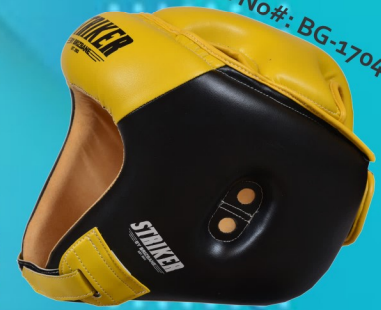
Art No#: BG-1704