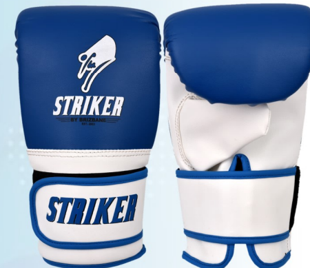
Art No#: BG-2205