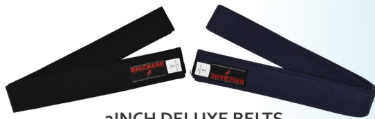
2INCH DELUXE BELTS Art No#: BELT-001008

Description: 2INCH Belts. 11 Rows of stitching. Made of Poly/Cotton blend fabric for easy care.