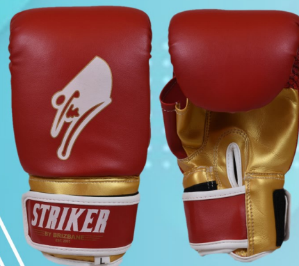
Art No#: BG-2201