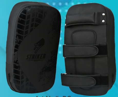
Art No#: BG-2103