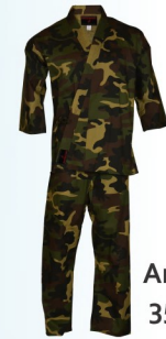
Art No#: 350-CAM