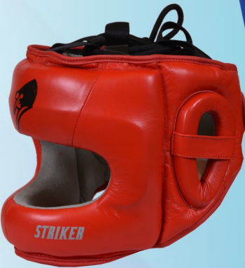
Art No#: BG-1707