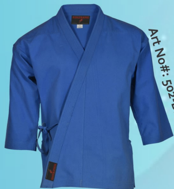
Art No#: 502-BLUE

100% Brushed Cotton Fabric Reinforced double stitched flat seams. Extra strength and room to move for a perfect fit.