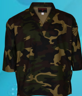
Art No#: 202-CAM