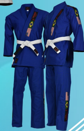
Art No#: 7800-BL NIPPER

Description: Cotton/Polyester blend fabric for easy care. Size 000 through 2 elastic waist with drawstring tie. Size 3 through 7 traditional drawstring tie waist. Reinforced double stitched flat seams. 10oz ribstop full cut design and 3-piece pant gusset. Extra strength and room to move for a perfect fit.