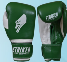
Art No#: BG-1518