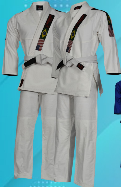
Art No#: 7800-W NIPPER

Description: Cotton/Polyester blend fabric for easy care. Size 000 through 2 elastic waist with drawstring tie. Size 3 through 7 traditional drawstring tie waist. Reinforced double stitched flat seams. 10oz ribstop full cut design and 3-piece pant gusset. Extra strength and room to move for a perfect fit.