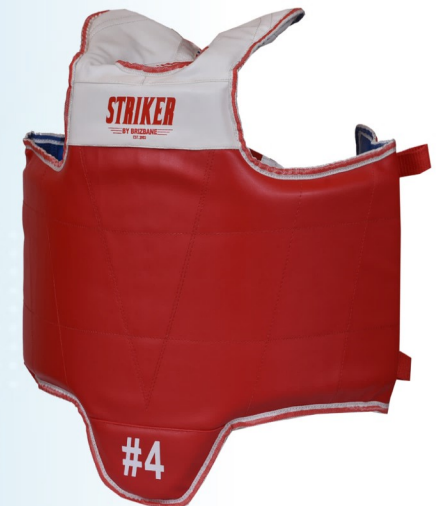
Art No#: BG-1804

Description: Artificial leather. 1" Elastic with webbing lace closer. EVA Foam padding. Size: XS to XXL.