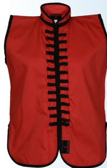
Art No#: 1110-RB