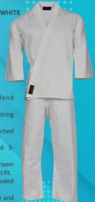
Art No#: 325-WHITE

Cotton/Polyester blend fabric for easy care. Elastic waist with drawstring tie. Reinforced double stitched flat seams. Full cut design and 3-piece pant gusset. Extra strength and room to move for a perfect fit. Free white belt included with purchase. Available in white and black.