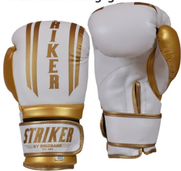
Art No#: BG-1513