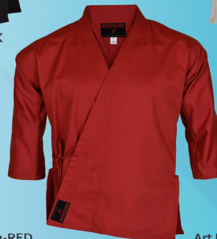
Art No#: 352-RED