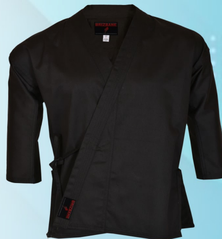
Art No#: 352-BLACK

Cotton/Polyester blend fabric for easy care. Reinforced double stitched flat seams. Full cut design for comfort and flexibility. Extra strength and room to move for a perfect fit.