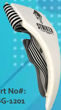
Art No#: BG-1201