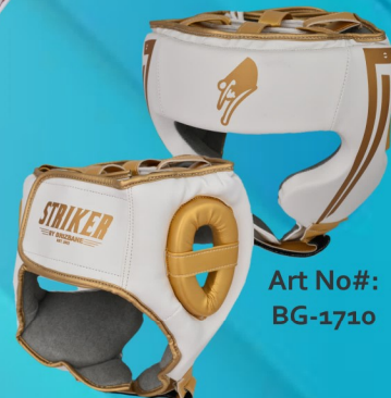
Art No#: BG-1710