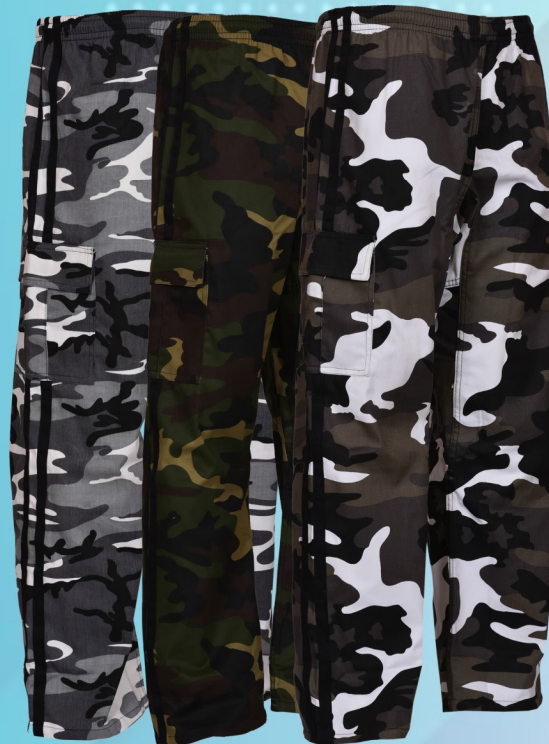
Art No#: 6208-CAMB

Cotton/Polyester blend fabric for easy care. Elastic waist with drawstring tie. Reinforced double stitched flat seams. Full cut design and 3-piece pant gusset. Extra strength and room to move for a perfect fit.