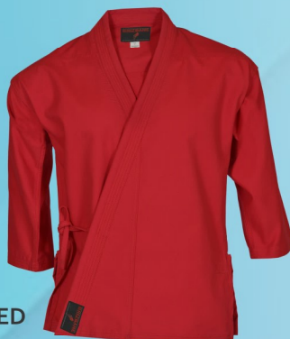
Art No#: 552-RED

100% Brushed Cotton Fabric. Reinforced double stitched flat seams. Extra strength and room to move for a perfect fit.