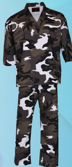
Art No#: 200-WCAM