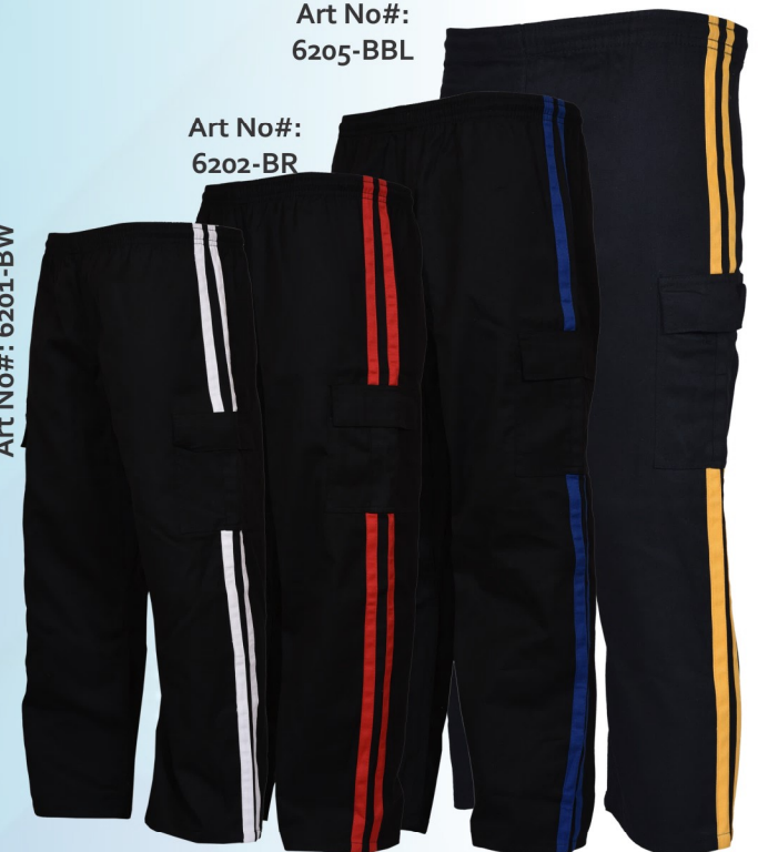
Art No#: 6202-BR