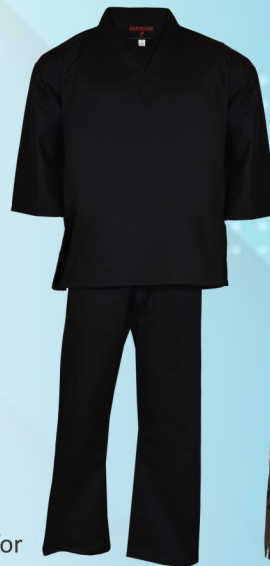
Art No#: 200-B

Cotton/Polyester blend fabric for easy care. Elastic waist with drawstring tie. Reinforced double stitched flat seams. Full cut design and 3-piece pant gusset. Extra strength and room to move for a perfect fit. Free white belt included with purchase.