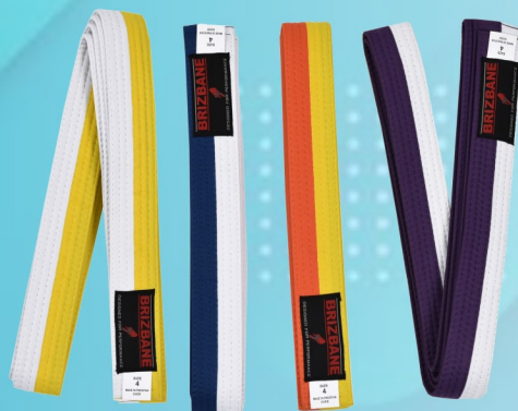
H/H COLOR BELTS Art No#: BELT-001004