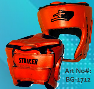
Art No#: BG-1712