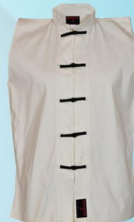
Art No#: 1100-WB