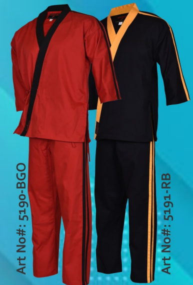
Art No#: 5190-BGO

Description: Top with red/white/blue collar and 3/4 sleeves. Pant with red/white/blue stripes down both legs. Cotton/Polyester blend fabric for easy care. Elastic waist with drawstring tie. Reinforced double stitched flat seams. Full cut design and 3-piece pant gusset. Extra strength and room to move for a perfect fit.