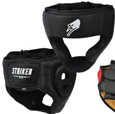
Art No#: BG-1701