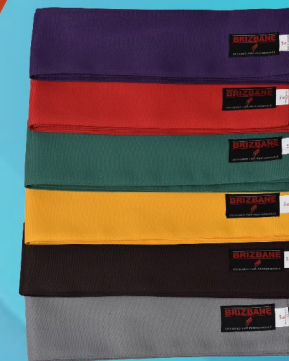
KUNG FU PC-SASH WITH STRIPE Art No#: SASH-001001