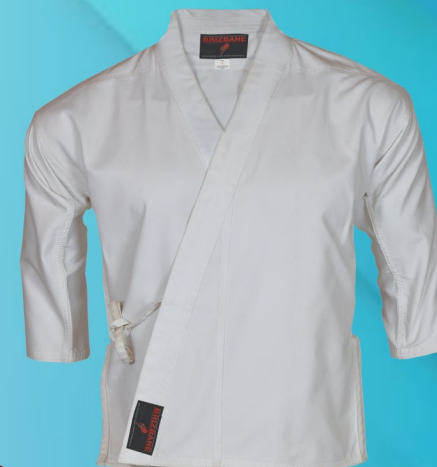
Art No#: 352-WHITE