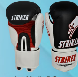
Art No#: BG-1523