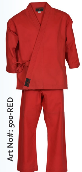
Art No#: 500-RED

Deluxe 100% brushed cotton fabric. Reinforced double stitched flat seams. Extra strength and room to move for a perfect fit.